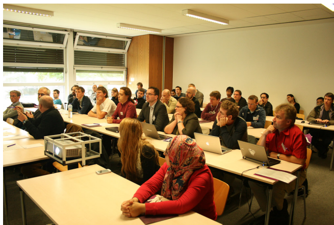
Fig. 2: Participants of the Kiel Declarative Programming Days 2013