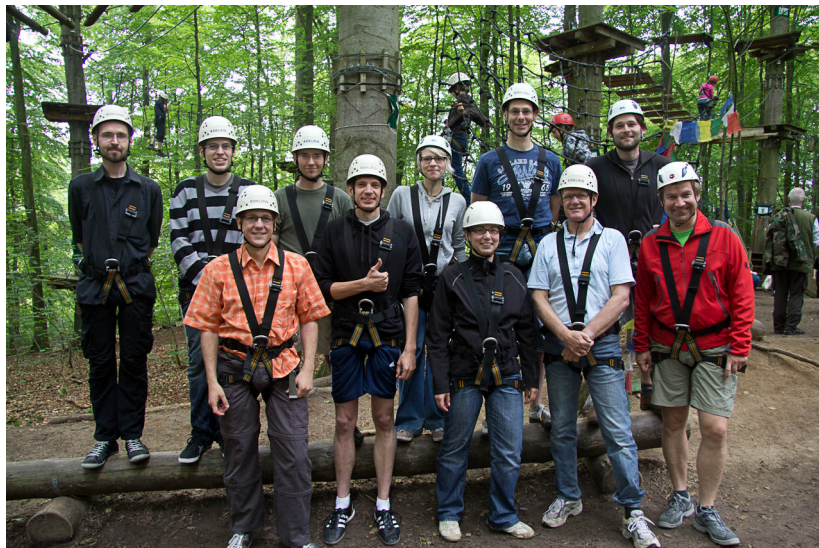
Fig. 1: The programming language and program development groups on a climbing trip

The scientific work of the research group involved all areas related to declarative programming languages, e.g. design, semantics, implementation, development tools, and the application of such languages. Declarative programming languages are based on clear mathematical foundations. They abstract from the underlying computer architecture and thus provide a higher programming level leading to more reliable systems. In particular, much of the research is focused on the integration of the most important declarative programming paradigms: functional and logic programming.