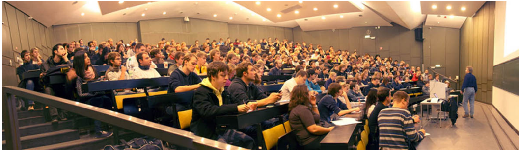
Fig. 2: Beginner students of the winter term 2011